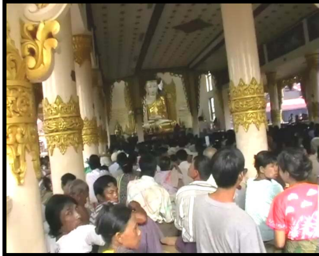
A temple, now a temporary shelter for the homeless cyclone victims

"I don't even know where to begin. People are in deep trouble. Those who lived in big houses are now staying in smaller ones and those in smaller ones before are now living in huts. There is no one to help us. We did receive some rice -- four milk cans of rice per family. That rice aid came from the residents of Ma-ubin and no other relief groups have been here yet. No one visited the areas up the Maletto Creek. I have, however, seen cyclone victims being fed in Ma-ubin. I am from Maletto Village. Villages were destroyed or are in ruins and some people remain and some have left. The difficulty for us is not being able to replant rice."